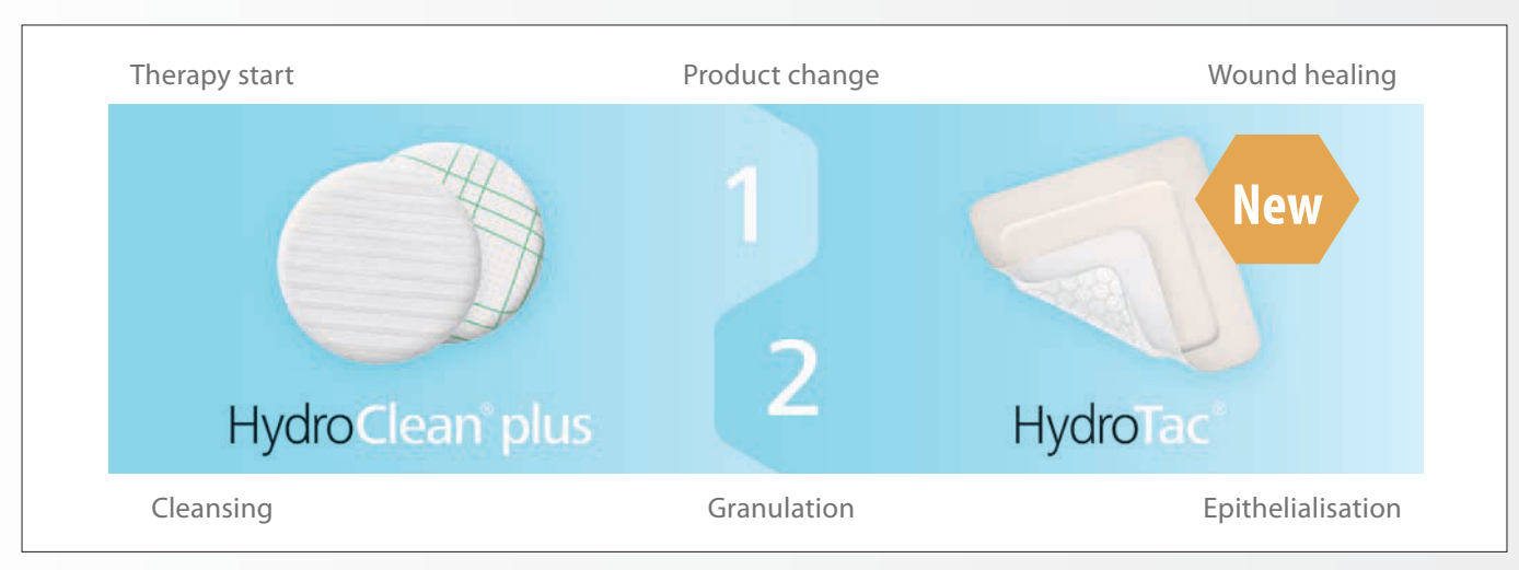
Figure 2. How does HydroTherapy work?

HydroTac® is a HRWD with AquaClear Technology. The dressing is made up of a hydrogel wound contact layer, covered by a foam, with an air-permeable, waterproof and bacteria-proof film backing. The wound side of the dressing features AquaClear