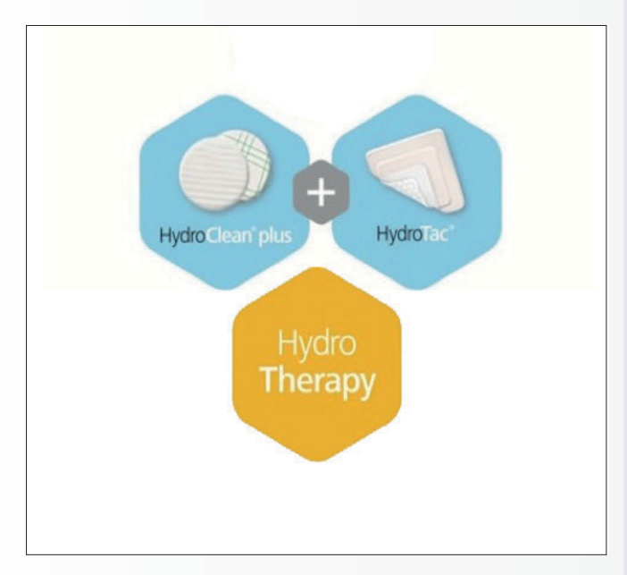
Figure 1. What is HydroTherapy?

et al, 2016). The evidence suggests that the elevated destructive biological components found in chronic wound exudate are responsible for tissue maceration (Rippon et al, 2016). Wounds exposed to free fluid (e.g. wounds covered with chambers into which saline is added) appear to benefit from many of the positive aspects of moist wound healing (Junker et al, 2013). The hyperhydration of wounds, whereby tissue is hydrated beyond what is a normally acceptable therapeutic level (e.g. in moist wound healing), has recently been proposed as a therapy for a variety of wounds (Rippon et al, 2016). The use of isotonic fluids in hyperhydration, the skin's ability to recover quickly from the effects of exposure to free fluid and the control by wound dressings of excessive proteolytic activity in chronic wound exudate combine to support healing.