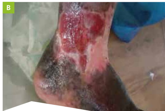
Figure 2 Case study 1. the wounds after 4 weeks of treatment: right (a) and left legs (b)