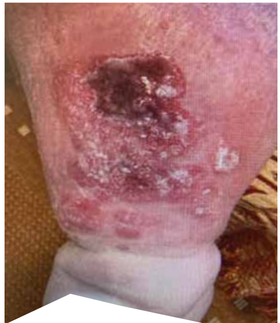
Figure 9. Case 4: the wound at the end of week 2

hot, most likely because of the poorly managed lymphoedema in the lower limb. It was decided that compression therapy would be beneficial at this stage. The limb was so large due to the lymphoedema that the nurse was unable to perform Doppler ultrasound assessment to calculate the ankle brachial pressure