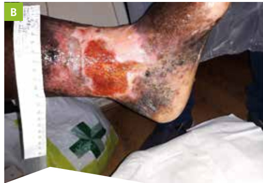
Figure 1. Case study 1: the wounds before the start of treatment with the superabsorbent dressing and compression therapy: the ulcers are on the medial aspect of the right (a) and left legs (b)