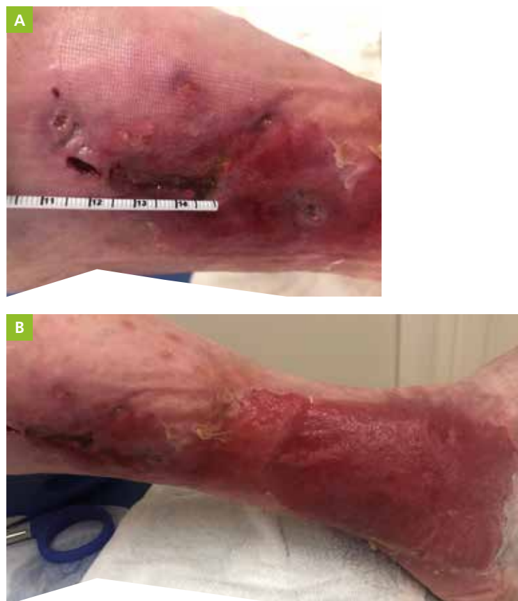
Figure 7. Case study 3: the wounds after 3.5 weeks of treatment

By week 4, the wound beds measured 2.5 x 0.5 cm and 1.5 x 0.5 cm. Further calcium deposits were removed from the wound beds. However, the volume of exudate had increased, resulting in strikethrough onto the compression bandage and a deterioration in the condition of the periwound skin. The patient reported an increased pain score of 6/10 and complained of pain between dressing changes. There were signs of local infection, with increased slough and moisture on the wound bed. The public health