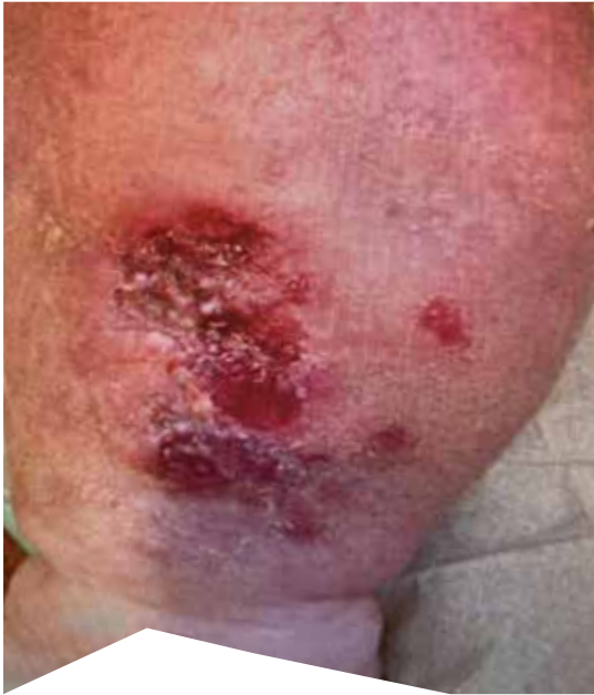
Figure 10. Case 4: the wound at week 4

index. However, a full holistic assessment was undertaken in which any arterial characteristics were ruled out. In addition, in a previous assessment, the lymphoedema services had deemed the patient suitable for compression therapy.