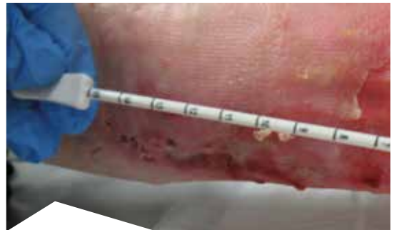
Figure 6. Case 3: the wounds after 2 weeks of treatment

changes three times a week. The wound beds were covered with 50% slough and buds of granulation tissue (20%). The remaining 30% of the wound bed consisted of calcium deposits. The patient's serum calcium and phosphate levels were normal.