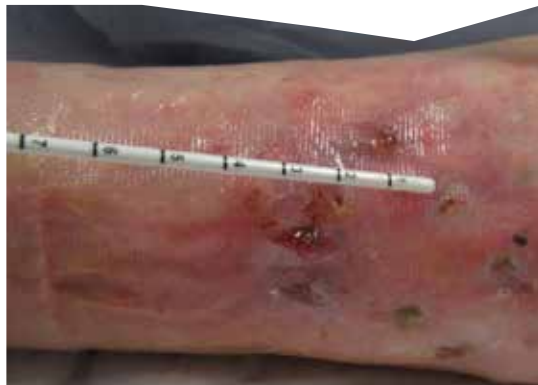
Figure 5. Case 3: the wounds at presentation