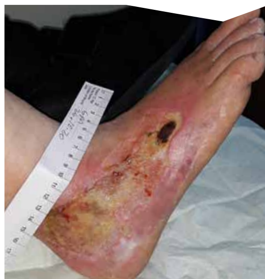
Figure 3. Case study 2: the wound before the start of treatment with the superabsorbent dressing and compression therapy

Prior to the referral, the leg ulcer had been managed by district nurses (DNs) with a 100% manuka honey dressing and a carboxymethyl cellulose (CMC) gelling fibre dressing. They found the wound challenging, and