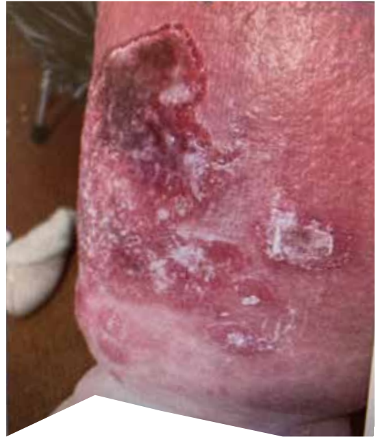
Figure 8. Case 4: the wound at week 1

On assessment, the leg was found to be red and