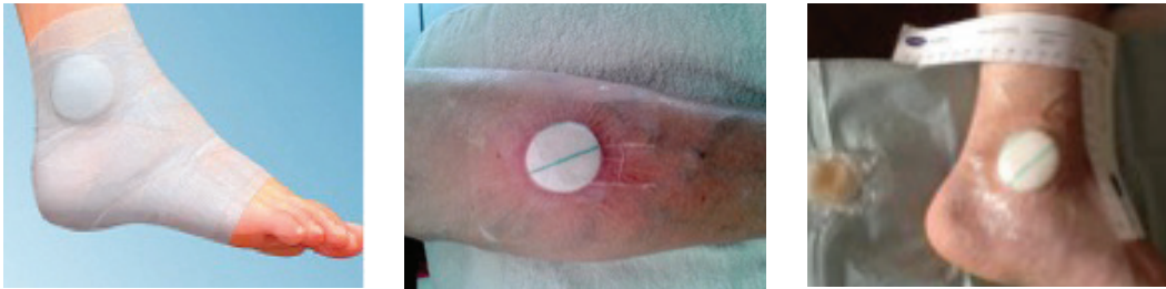
Figure 4. Schematic representation of HRWD fixed at ankle wound (left) and two clinical examples of HRWD fixation over wound using transparent film (middle and right).