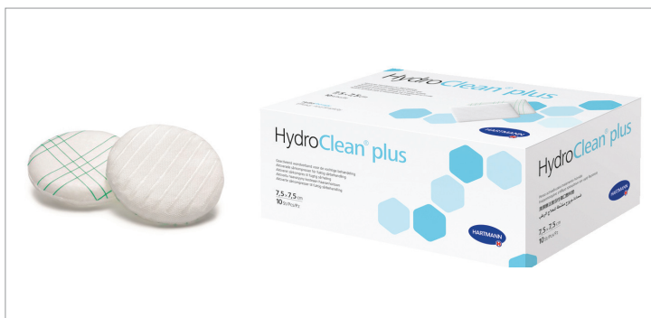
Figure 1. HydroClean plus — a hydro-responsive dressing (HRWD).

The wound contact layer of HydroClean plus is composed of a non-adherent hydrophobic layer which conforms well to the wound surface. The presence of pores within the wound contact layer allows free exchange of Ringer’s solution and wound exudate (Mwipatayi et al, 2005). This layer also contains silicone strips to prevent the dressing from adhering to the wound, aid atraumatic dressing removal and minimise irritation of the wound or