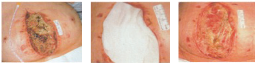
Figure 6. Clinical example of wound debridement following application of HydroClean plus to a dehiscent abdominal wound. Significant removal of necrosis and slough by Day 2 after dressing application.

tissue. Overall, no statistically significant difference could be found between the two treatment groups and the conclusion of the study was that both autolytic debridement by HRWD and the enzyme debridement were equally effective.