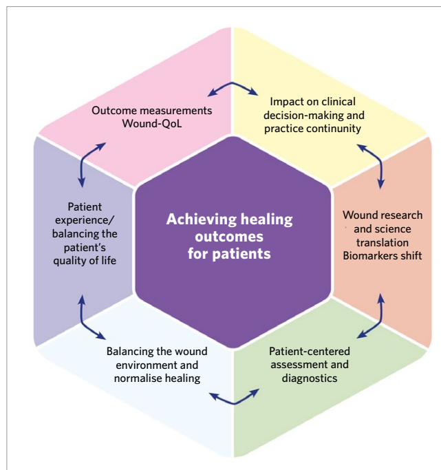
Figure 4: Achieving healing outcomes for patients - interconnected factors