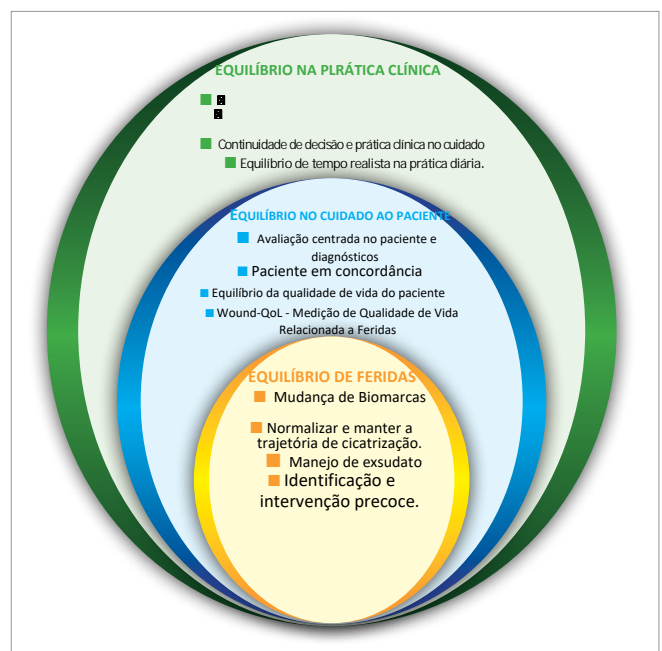
Figura 1: O conceito de equilíbrio da ferida.

Este documento é o resultado de uma reunião de especialistas em cuidados com feridas internacionais realizada em Frankfurt, Alemanha, em novembro de 2022. Isso representa o primeiro passo na jornada de educação do 'equilíbrio de feridas'. Trabalhos adicionais estão planejados para expandir o conceito e fornecer aos clínicos uma compreensão aprimorada das melhores práticas para ajudar a otimizar os resultados para os pacientes, alcançando o equilíbrio de feridas.